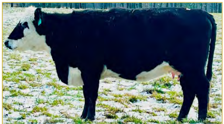
LOT 59 | AMOS MISS FOCUS 7X2 1X2

Cow: A young, coming 4-year-old, easy-keeping female supported by foundational Black Hereford genetics. Her dam is a flush mate to Lot #12, a standout individual sold in the 2023 Source of Genetic Excellence Sale by Windy Hill Black Hereford. She is Homopolled. AI bred on 12/8/24 to CA KT Bodacious 2202 HB027828. Pasture exposed from 1/1/25 to present to 3C's L030 Impressive 22-J 736, a herd sire sired by PLC 158 CMA Red Killer 22-J and acquired from Triple C Black Herefords. This female represents a solid genetic foundation and breeding potential for your program. Heifer Calf: HB033577 - This is a rare opportunity to acquire top-tier Black Hereford genetics in one exceptional package. This daughter of BCKST Black Dynasty 2420ET stems directly from our foundational Black Hereford bloodlines. With an actual birth weight of 73 lbs and proven growth potential in her pedigree, this female offers calving ease and the ability to enhance herd performance. DNA data will be provided on sale day.