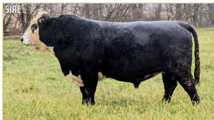
SIRE OF LOT 47

This coming 4-year-old Thunderstruck daughter will have plenty of friends come sale day. Her grandsire, NJW Z17 Vaquero 25C, needs no introduction to Hereford breeders. Semen on this elite Sire of Distinction is next to impossible to find. Vaquera's disposition is second to none and will make a great foundation cow for a young breeder seeking elite genetics in a gentle package. She is due in early March to our "secret weapon" RHBH Outcrossed Sensation L5 (HB028030), a phenotypically flawless son of DCD Sensational 711 that we acquired from Rode House Black Herefords in 2024. This mating could be very special so help yourself here!