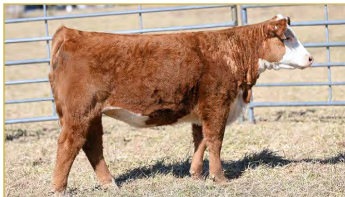
LOT 20 | WP VICTORIA M001

This heifer has been my favorite ever since we weaned her. She is thick, has eye pigment, and just has the look of a great brood cow. Boasting (7) EPD values in the top 10% and (10) in the top 25% she is truly elite in terms of merit. She is by Cuda and out of a first calf heifer whose dam is the oldest and most maternal cow in our herd. This heifer ranking in the top 1% of the breed in TM is indicative of that. This heifer is truly the kind you can build a herd off of so don't let her slip by you on sale day. Selling with (2) straws of semen by HB020550, a fantastic homo black/poll calving ease bull by Smith Black Herefords in Iowa (buyer to pay shipping). Sells open and ready to breed.