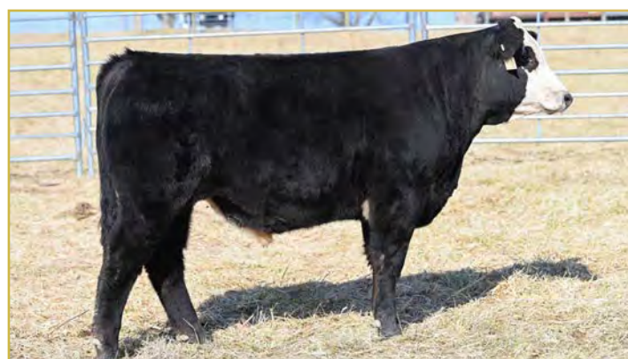
LOT 31 | WP SITZ M003