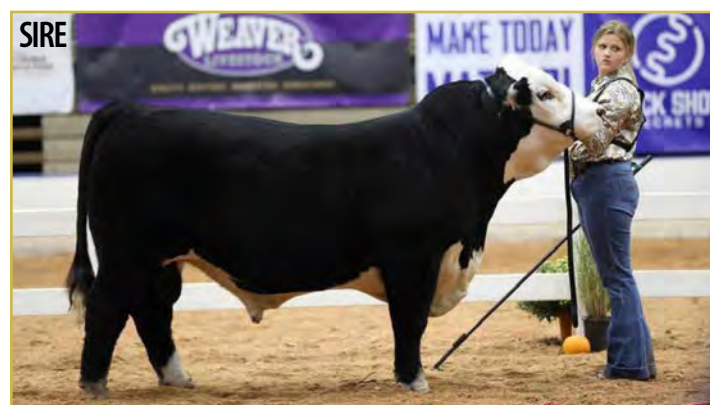
SIRE OF LOT 23

This Purebred 95.375% HX is one that you don't need to let slip by without paying attention to her age. She is not even a year old but is stacked on top and bottom coming from multiple UPS Herefords including UPS 2296, Vin-Mar Wildcat, and Miss Sensation 3084. 2435 is another one that comes from JCR Coop HR 2296 102 which is a special built bull like his sire UPS 2296. He was Champions Purebred Jr. Nationals 2022, Champion Purebred and Reserve Champion Black Hereford at Cattlemen's Congress 2023 just to name a few. She is tested DB Free.