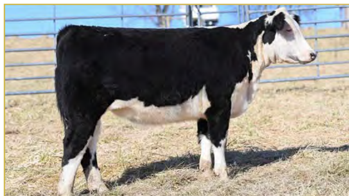
LOT 5 JHC NORA 3408

Sired by Ol' Digger, JCR Sonic Crush 015 (HB018076) out of "Deuce", a 3c's D02 of JB Classic Smith, Digger and Deuce have produced several outstanding calves for us over the years. Nora's pedigree traces by to KT Miss Iowa on the bottom and Jo Bulls genetics on the top. Beautifully chrome marked. Solid framed heifer with just the right amount of chrome. Homo black, so your breeding options are wide open with this girl.