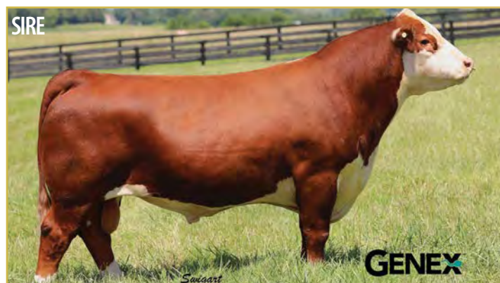
SIRE OF LOT 12

Here is a young February F1 Blueprint heifer that has great genetics. She is feminine with tremendous depth and rib and is also long bodied. Bid with confidence.