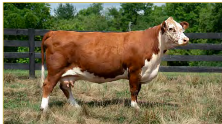
LOT 46 | NJW 76S 72C STARDUST 182E ET