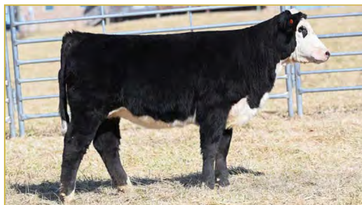
LOT 6 JHC GLORIA 3407

Take a close look at this goggle eyed beauty!! Not much to find wrong with this girl. Her dam is the best F1 on our farm from Eagle Country Black Herefords. Her pedigree speaks for itself. She has the frame to be an outstanding calving ease cow.