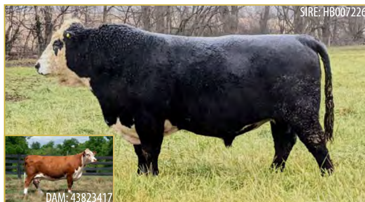
LOT 62 | 3 IVF EMBRYOS