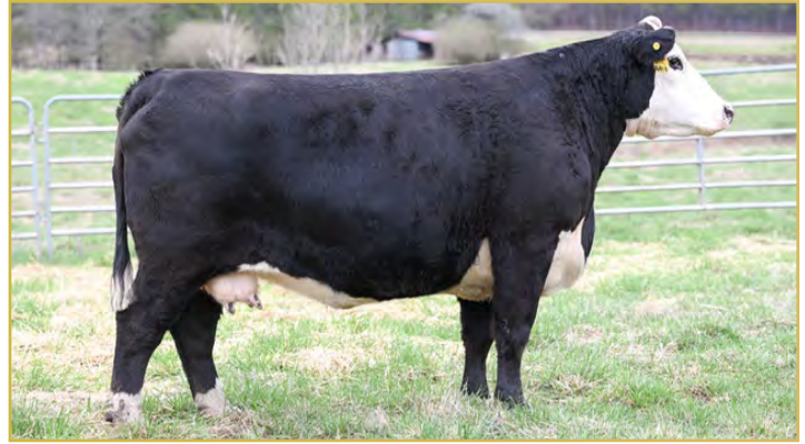
LOT 40 | VCF 4217 ANNABELLE E01 H15

Annabelle had the Top Selling Bull last year at the TBHA Sale, She is a Brood Cow and raises a Brood Calf everytime. From Elite 3C's Evelyn Donor and Black Jack (known for having great females). Stunning Phenotype / Breed Improving Genetics / Purebred. DOB: 08/18/20. Black Hereford 89.25% - Purebred Female. Homozygous Polled. Sells bred to KHK ON BOARD 327 ET. Elite DAM & SIRE needs no Introduction to ABHA Folks!