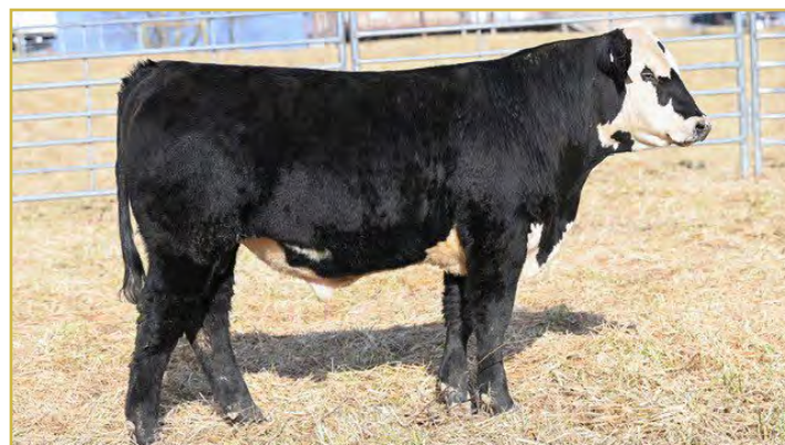
LOT 30 | WP ICE MAN M007