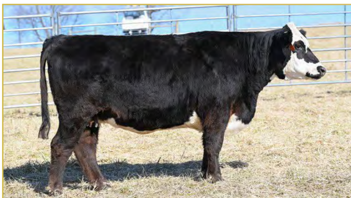
LOT 51 | WP VERA J014

If you're looking for a Purebred female that can really elevate your herd, there look no further than J014. This google eyed young cow has a perfect udder and did a great job raising her first calf. J014 is a powerful young female ranking in the top 20% for both WW and YW and when you combine that with top 1% Docility and TM you've really got the makings of an ideal producer. This cow is by the Torque bull stemming from the Huth Herefords program in Wisconsin and is out of our E001 donor who has consistently raised one of the best calves year in and year out. Exposed to WP Trek K049 and CMF 242D Julian 703J from 8/1/24 to 12/8/24. Confirmed bred (vet called 3-4 months & bull calf on 1/9/25).