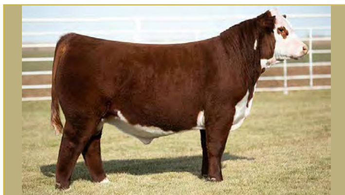
SIRE OF LOT 39

Difficult to part with a Genesis Daughter like Diamond - the kind to Build your herd, DONOR ALERT. Black to the Ground Elite DAM & SIRE needs No Introduction to ABHA Folks! DAM JM BLZ MISS BLAZER 124T 9062 sold at the 2021 ROYAL bred by JM & Blazer Farms. Stunning Phenotype / Breed Improving Genetics / Purebred. Sells OPEN Ready to Breed! CALF: HB033817 DOB 2/3/25 Black Hereford 89.6% - Purebred Bull! Calf is a BENCHMARK GENESIS CROSS stemming from TWO GREAT ABHA DONORS!! Genetics to the MAX! Hard to find, DNA Pending