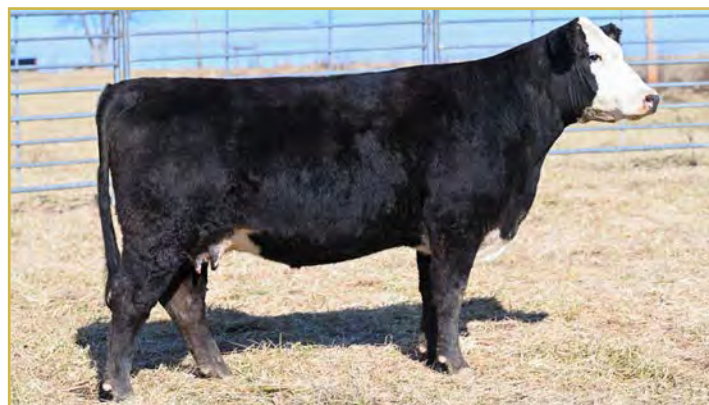
LOT 52 | WP TARGY J005

J005 is an elite F1 cow that was bred, born, and raised at Winters Plantation. This young female has an elite EPD profile with (7) different values in the top 10% of the breed (WW, YW, TM, CW, CREA, MAR, API, and TI). Her pedigree is stacked with great producers on both the Angus and Hereford side including On Target, Revolution, 3027, Objective, and New Design. She has a perfect udder and did a great job raising her first calf. Finding young cows like this coming with their second calf doesn't come around very often. Exposed to WP Trek K049 and CMF 242D Julian 703J from 8/1/24 to 12/8/24. Confirmed bred (vet called 3 months & heifer calf on 1/9/25).