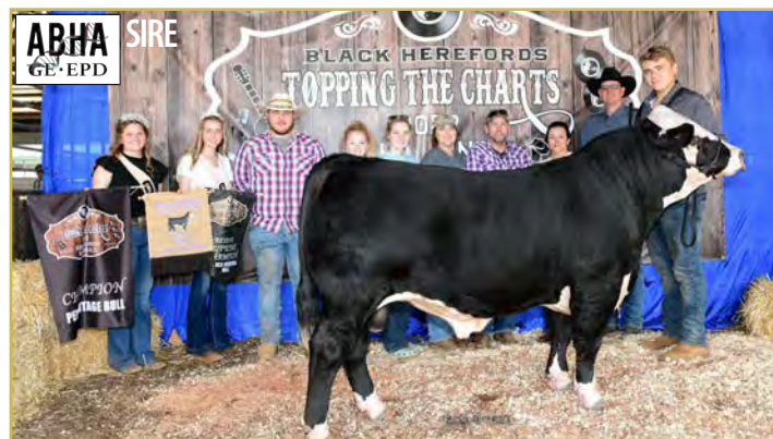
SIRE OF LOT 28

When we were finally able to get our hands on some Sitz Upward 907R semen we had dreams of having a F-1 daughter that we hoped one day would be a foundational piece to our herd for years to come. Well as luck would have it we were blessed with M003 instead. This young F1 bull is by far the best we've raised to date even though he is out of a first calf heifer. If you are a commercial cattleman looking for elite curve bending EPDs then don't let this guy pass you by on sale day. M004 has a top 10% CED along with top 3% WW & YW EPDs. Combine this with a top 15% CREA and 10% MARB and you really have a bull that is set up to sire some outstanding progeny destined for the rail.