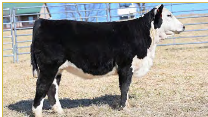
LOT 4 JHC ROSABELLE 4410

Take a look at this big, stout heifer! Big middled and sound footed. Looking for a homo black and homo polled heifer that will produce for years? Then this girl is for you. Sired by Ol' Digger, JCR Sonic Crush 015 (HB018076) out of Guybro Ms Shooter E054, her pedigree is stacked. Don't let this one get by you.