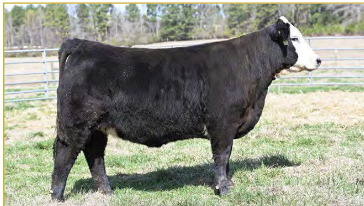
LOT 9 | 3C'S L037 OF PRESS ON 799 KR009

We like to set the bar high here at Triple C. We feel that this Press On Heifer does just that. Elegant made, big boned, and black to the ground. Since there is no Press On available any more this one is hard to let go. Sells open and ready to breed, also sells with 2 units of your choice on any 3C's bull just to sweeten the pot.