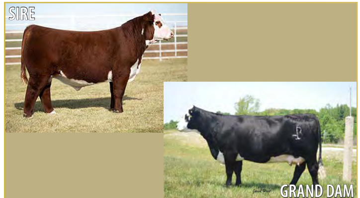
SIRE AND GRAND DAM OF LOT 42

AMAZING UDDER, This one peeks for herself. Look at her Calf, DONOR ALERT. Build your herd! DAM JM BLZ MISS BLAZER 124T 9062 sold at the 2021 ROYAL bred by JM & Blazer Farms. Elite DAM & SIRE needs No Introduction to ABHA Folks! Stunning Phenotype / Breed Improving Genetics / Purebred. Sells Bred; A/d to C TRIPLE YOUR MILES 8/24 12/29/24 and cleaned-up w/KHK Onboard. BULL CALF: HB033496 SIRE: KHK ON BOARD 327 ET Homoblack / Homopolled 89.6% Black Hereford DOB: 9/25/24