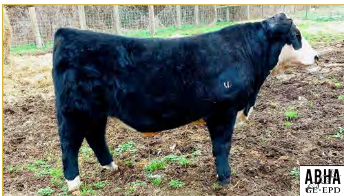
LOT 35 | CT'S CHIEF PONTIAC M01

APPROVED HERD SIRE. This flashy young herd bull prospect has all the makings to make a change in any registered or commercial herd. Sound in his make, googled eyed and backed with a killer pedigree this guy is a standout all over. He keeps getting better as he continues to grow and mature. Homozygous Polled & 85%.