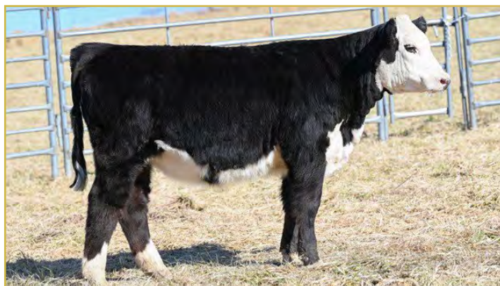
LOT 7 | WP CHARLIE M008

This Purebred heifer is packed with style and has all the makings of a great cow. She has a 12.7 CED value while also ranking in the top 25% of the breed in WW & YW. When you combine that with a top 15% Milk and a top 1% in docility you have all the makings of a great cow. She is backed by genetics including Belle Air 6011, Mytty In Focus, SHF York, 3027, and 789T. This heifer is the most gentle we have on the farm and is especially hard to let go. Sells open. DNA confirmed Homoblock