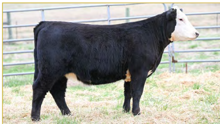
LOT 38 | BCR H194 COTTON LILY L112

TopShelf Female! Difficult to part with COTTON LILY - the kind to Build your herd, and make $. COTTON LILY, needs no introduction - showed in the 2024 Junior Nationals. Stunning Phenotype / Breed Improving Genetics/Show Quality. Breed COTTON LILY to any Hereford(horned or not) and get Black Polled Purebred Calves!! Sells bred, AI'd to BOYD 312 BLUEPRINT 6153 on 12/29/24. Cleaned up with KHK ON BOARD 327 ET until 2/15/25