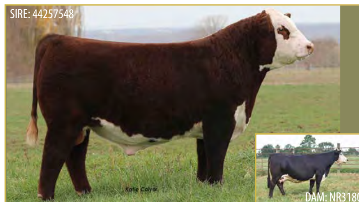
LOT 61 | 4 NUMBER 1 EMBRYOS