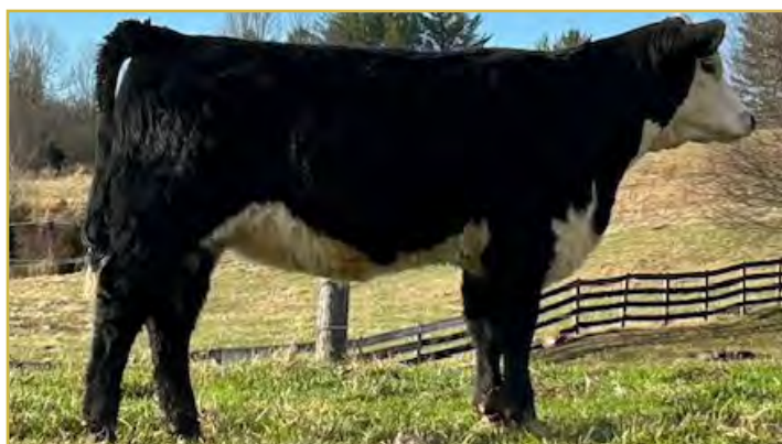
LOT 10 | RCF RANSOM MAGGY M913 J12

Here's an absolutely gorgeous purebred heifer that is really hard for us to let go. She's looked great right from the start and is an absolute favorite of ours. We love her thickness, depth, and the way she is marked. Her beautiful dam is by the ABS Bennett Acclaim and has shown herself to be an outstanding producer. This one will turn heads. Homo black & Homo polled test pending.