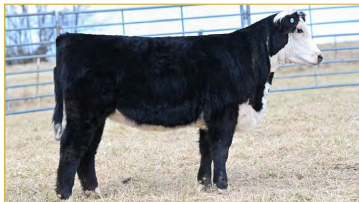
LOT 3 CHOLTF JOLENE 3402

Here's a homo black and homo polled heifer that will catch your eye. She was really hard to let go but we wanted to put our best in the sale. One look at her and you will see why. Clean fronted, short marked and black to the ground. Take her home and breed her to the bull of your choice.