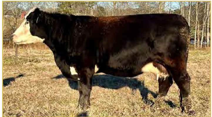
LOT 57 | TATES JES 90B1 1DY1

Cow sired by BCKST Black Dynasty 2420 ET and a daughter to the Lot 17 sold in last year's Source of Genetic Excellence Sale. Sells with a heifer calf sired by Turn Me Loose HB025458. Born 10-26-24 with a BW of 82 lbs. Cow was bred on 12-30-24 to CA KT BLK Thunder 2354 HB020907. CALF: HB033787