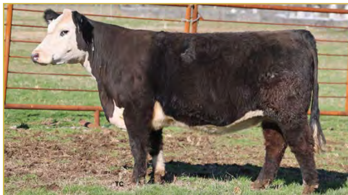
LOT 49 | FD HARD CANDY 7A 028X 924

HOMOBLOCK HOMOPOLLED high percentage coming 4-year-old here! Check out this well-made Jackhammer daughter. She's got a lot of big names behind her, and she wouldn't be selling but we have several like her. She's one to build a herd with. AI bred 12/10 to CA KT BODACIOUS2202 and pasture exposed 12/15 to 2/1 to P44516362 Commander and HB030601 On Time, one of our HOMOBLOCK sires. Confirmed bred A.I. Resulting calf will be Homoblock and Homopolled.