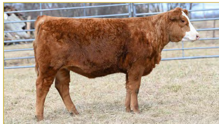
LOT 21 | WP LEXY M002

If performance is important to your cow herd then look no further than this google eyed HX heifer right here. She has (6) EPD values in the top 5% of the breed and (13) in the top 25%! Sired by NJW Endorsement and out of one of the best young F1 females in our herd this heifer is backed by great genetics. This heifer is loaded with style and is the front pasture kind. Selling with (2) straws of semen by HB020550, a fantastic homo black/poll calving ease bull by Smith Black Herefords in Iowa (buyer to pay shipping). Sells open and ready to breed.