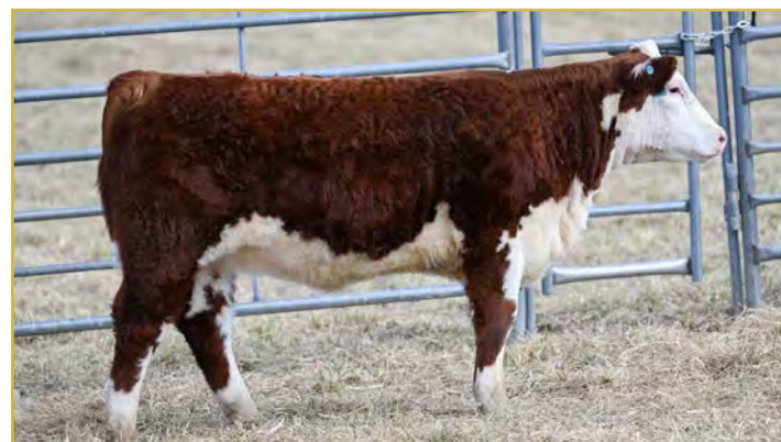
LOT 22 | SSF STEADFAST LADY M173 156J

This heifer is another first offering in this year's sale from NJW 202C173DSTEADFAST 156J ET. The sire is out of some of the best Herford genetics in the breed, NJW 792Z311 ENDURE 173D ET and the maternal powerhouse NJW 160Z8Y HOME MAKER 202C. The dam is a really nice Resolve cow. This female will add some great genetics to your herd.