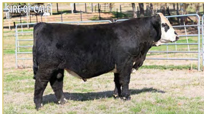
LOT 45 | SIRE OF CALF

Cotton Candy is hard to speak about, Coming from a Donor like 3Cs Evelyn and Genesis, you wont find a better Phenotype, Hard to part with her. DONOR ALERT! Elite DAM & SIRE needs No Introduction to ABHA Folks! Stunning Phenotype / Breed Improving Genetics / Purebred. Sells OPEN Ready to Breed! CALF: DOB BEFORE SALE DAY Black Hereford 85.25% Percentage Calf SIRE: KHK ON BOARD 327 ET