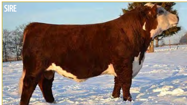
SIRE OF LOT 37