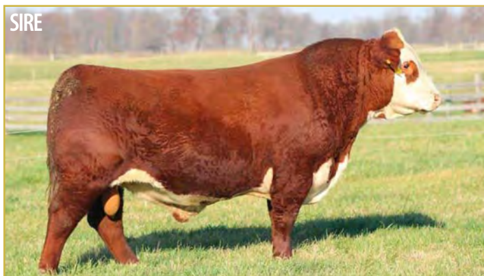
SIRE OF LOT 15