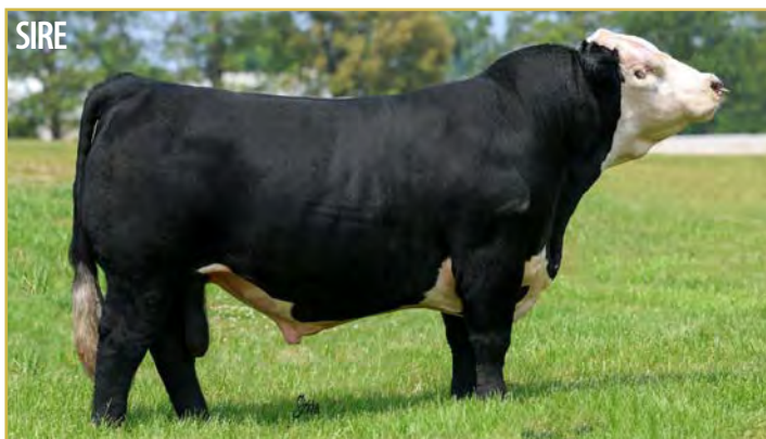
SIRE OF LOT 32