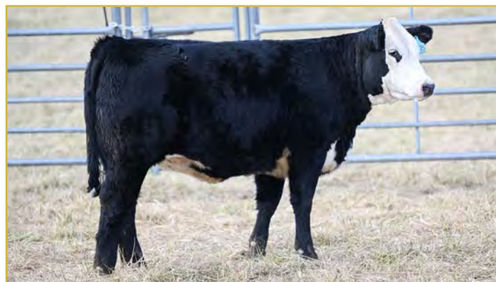
LOT 11 | SSF MS ICONIC LOGIC M005 H194

This heifer is a great cow prospect for any herd. A 91% purebred out of BCC SSF 6110 ICON F150 H194 and an 8622 daughter that has been a trouble-free producer ever since she was a heifer. His dam is a beautifully uttered 9-year-old with a super consistent calving record. Bid with confidence on this one.