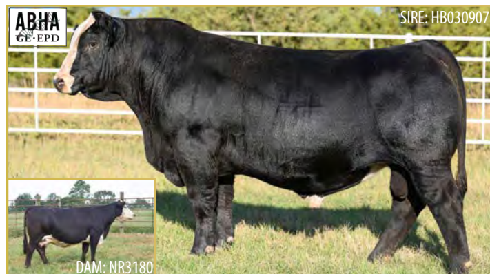
LOT 60 | 4 NUMBER 1 EMBRYOS

ILR LADY SMILES 911 IVF embryos by national champion LANGSFORDS CF KASANOVA 2002. A big-time producing cow with all the bells and whistles. The cow still has a beautiful udder with age. Guaranteeing 1 pregnancy if implanted by a certified technician