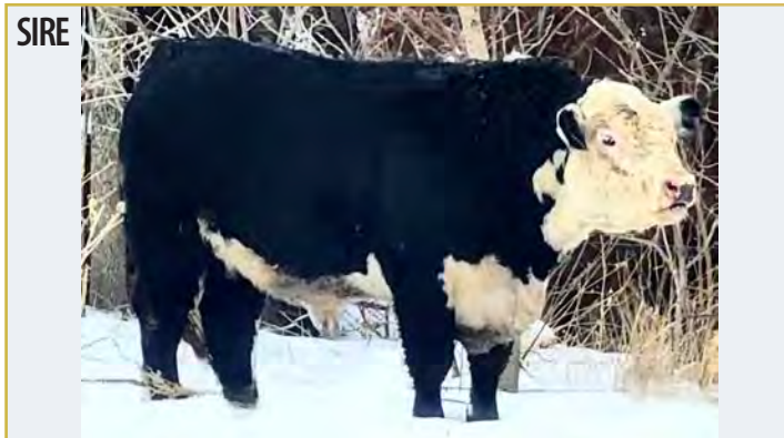
SIRE OF LOT 33