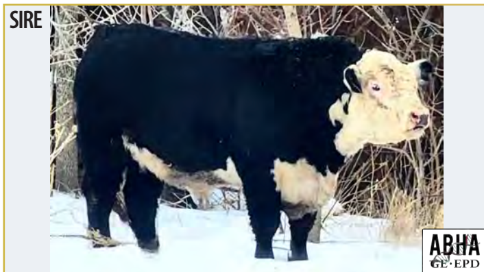
SIRE OF LOT 33