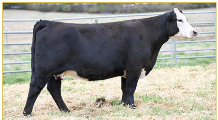
LOT 43 | VCF 3C'S 799 LILY 1921 J18

DONOR ALERT- TopShelf Female! Difficult to part with a Donor like LILY - The Kind to Build your Herd. To Soften the Blow, LILY x LANDSLINGER Purebred ET Calves hitting the Ground soon! Lily's first heifer, COTTON LILY, needs no introduction - Showed in the 2024 Junior Nationals. PRESS ON is known for Great Progeny, and LILY Serves as a Prime Example. BF 4158 LENA 1921 sold at the 2021 ROYAL bred by Burns Farms. Memories; Elite DAM & SIRE needs No Introduction to ABHA Folks! Stunning Phenotype / Breed Improving Genetics / Complete Package! Breed Lily to any Hereford (horned or not) to get Black Polled Purebred Calves! Sells Bred; A/d to Johnny Bravo 12/29/24, cleaned-up w/KHK Onboard. HEIFER CALF: HB033390 SIRE: KHK GENESIS BLAZER 159 ET Homoblack / Homopolled 83.6% Black Hereford DOB: 10/5/24