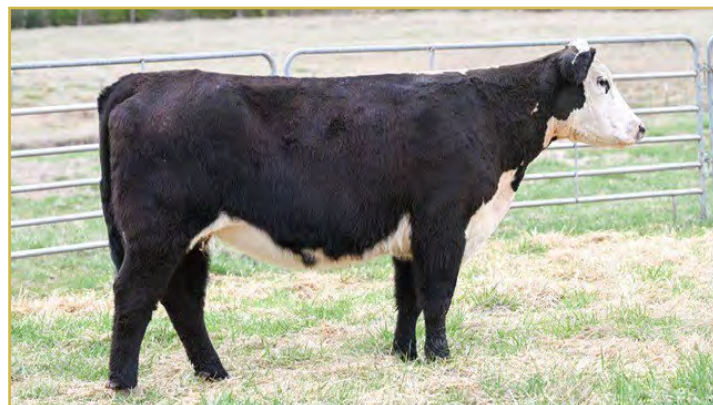
LOT 44 | VCF 8240 DARLENE 1217 K88 ET

HARD TO FIND A COW LIKE THIS. Build your herd, or Great Donor Prospect. Brood Cow. Elite DAM & SIRE needs No Introduction to ABHA Folks! Stunning Phenotype / Breed Improving Genetics / Purebred. Darlene is The Best Benchmark daughter we have at BCR. She would serve as a GREAT Donor Prospect. DONOR ALERT. Sells Bred; A/d to Sexed Houston 12/29/24 and cleaned-up w/KHK Onboard BULL CALF: HB033497 89.6% Black Hereford DOB: 9/29/24 Bull Calf is a BENCHMARK GENESIS CROSS stemming from TWO GREAT ABHA DONORS!! Genetics to the MAX!