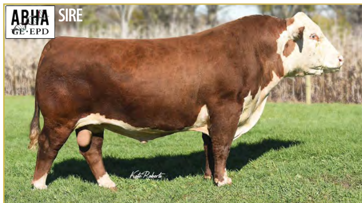
SIRE OF LOT 25

APPROVED HERD SIRE. TAEP approved cost share Homozygous polled Dancer Excede K01 is a well put together bull. When you come to a sale looking for a bull to build your herd, look no further if you study him on both sides of his pedigree you will find greatness. His females will definitely be the best calf raising productive cows in your community. His sons will stand out from day one to maturity. His EPD swing from birth to yearling is awesome. Let him take your herd to a better place.