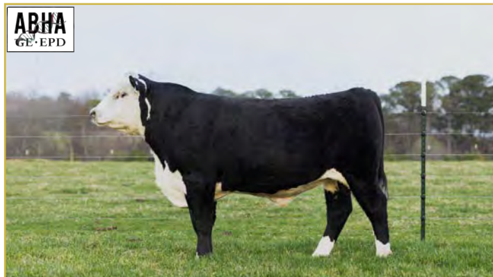
LOT 26 | WF VEGAS GAMBLER L15

APPROVED HERD SIRE. If you're looking to add skeletal extension to your calves, this very gentle, homozygous polled bull will add the substance of bone with plenty of growth to go with it. He is in the top 35% for WW and has 8 other EPD traits also in the top 35%. Notice his adjusted weaning weight. This bull also has excellent testicular development which is very important in getting cows settled in first heat.