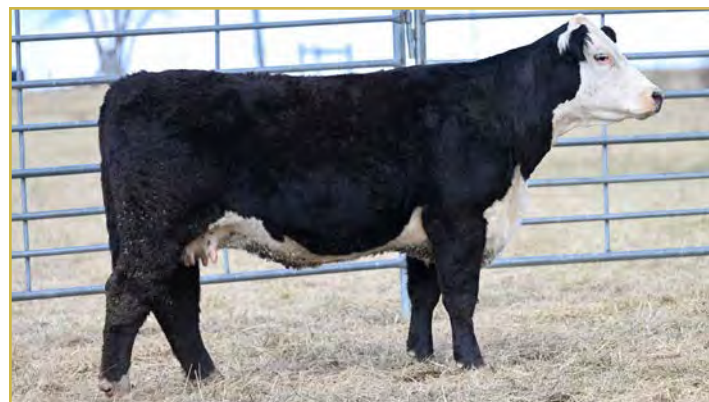
LOT 54 | JM MS ON LADY 799 1703 H203 ET

Check out pedigree behind this young cow. A high percentage Black Hereford that is bred to our herd bull that we are really excited about, SIMS FAST KASH 901 K78 ET ET. The service sire a total outcross in the breed, sired by the outstanding Hereford bull Fresh Prince and combined with the championship Black Hereford genetics of his dam, BLZ HALLE 6014 C31 901. This is one of the first two offerings from FAST KASH. Pasture exposed 12/5/24-1/23/25 for a fall 2025 calf.