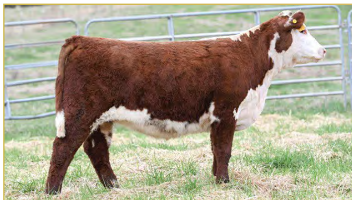
LOT 24 | BCR 018 LUCKY STAR M119

LUCKY STAR Combines Bar Star Fresh Prince in Loewen Genesis G16 and ABHA Icon Donor. JN BALDEE 1217 DAM! Pauline, her DAM, BCR Genesis Daughter, is Lead Donor Quality, containing BAR STAR FRESH PRINCE 018 ET/ JN BALDEE 1217 / LOEWEN GENESIS G16 ET. Unmatched Genetic Combination! Show Quality Phenotype. Stunning Phenotype / Purebred / Breed Improving Genetics. Sells OPEN Ready to Breed Black Hereford 95% - Purebred Female