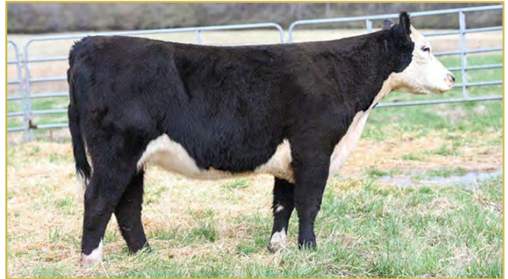
LOT 41 | VCF 8240 CAROLINE 1217 K78 ET

CAROLINE is 1 of a Kind! - The Kind to Build your Herd. Elite DAM & SIRE needs No Introduction to ABHA Folks! Stunning Phenotype / Breed Improving Genetics / Purebred. Sells Bred; A/d to Triple Your Miles 12/29/24 and cleaned-up w/KHK Onboard HEIFER CALF: HB033498 SIRE: KHK GENESIS BLAZER 159 ET Homoblack 82.6% Black Hereford DOB: 11/28/24