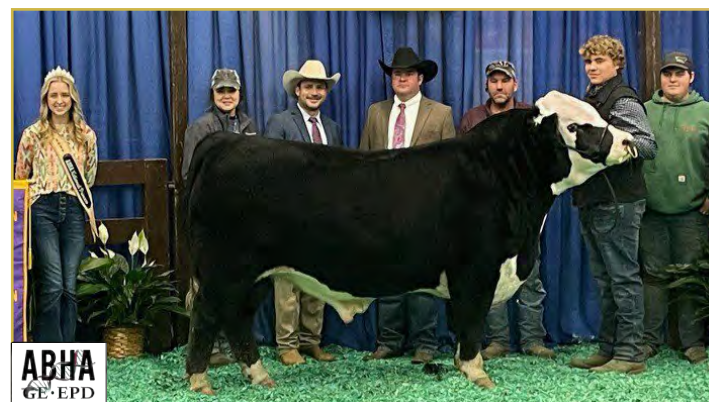
LOT 29 | JCR'S DOUBLE TRUST CAT 107 ET