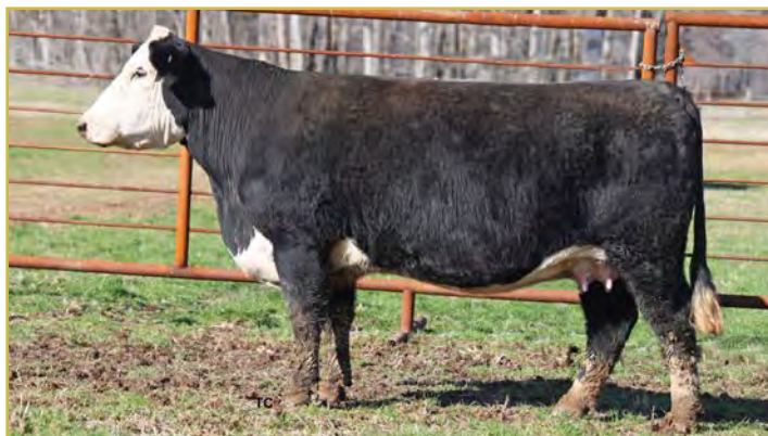
LOT 50 | JM MS CAT ON LADY 1123 H017

H017 is a great 5 year old. She's been very productive, giving us some great calves. We probably wouldn't sell her if we weren't trying to downsize. She goes back to the great 1123 donor and Catapult. AI bred 12/10 to Jackhammer 7A and pasture exposed 12/15 to 2/1 to P44516362 Commander and HB030601 On Time, one of our HOMOBLOCK sires. Confirmed pregnant, likely to pasture exposure.