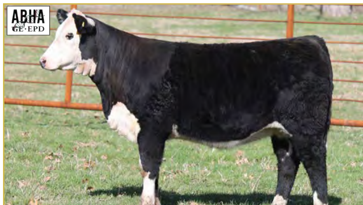
LOT 8 | FD CLASSY CAT H200 2066 M043

Classy Cat really lives up to her name. This girl catches your eye every time she can. With a beautiful paint job and a near perfect frame, she'll work for anyone. Put her in the ring or take her home to make some deep, soggy middled calves. These Hell Cat daughters can go anywhere.